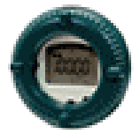
Indicator with LPS